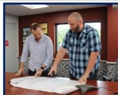
Consulting & Environmental Graphic Design